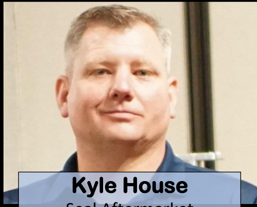
Kyle House Seal Aftermarket

GM/Ford 10-speed – Learn what's in store with the next generation of transmission from Ford and GM. Take apart one of these here BEFORE you see one at your shop!